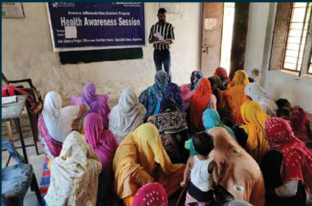
ROOPVAS VILLAGE, TIJARA RAJASTHAN