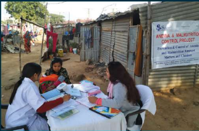
SECTOR 56 SLUM, GURUGRAM