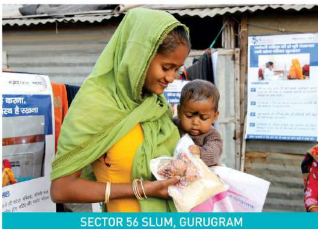
SECTOR 56 SLUM, GURUGRAM