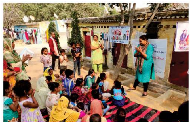
SURYA VIHAR DELHI