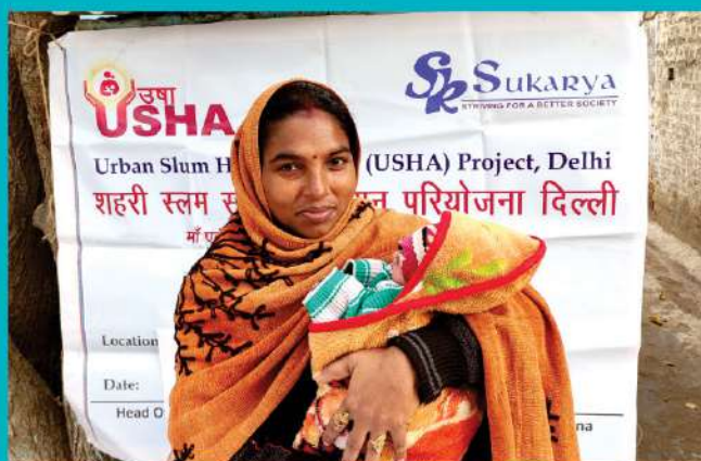
SURYA VIHAR, DELHI

HOME VISITS AND FOLLOW-UPS WERE MADE FOR THE BENEFICIARIES