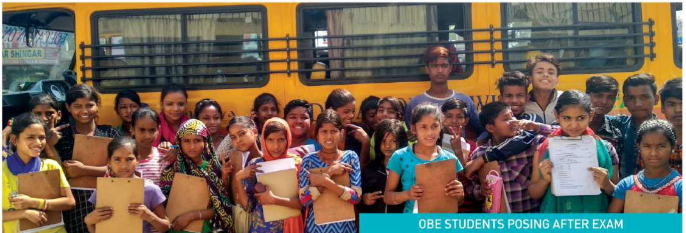
OBE STUDENTS POSING AFTER EXAM

Education on Wheels (EOW) is a unique program where the school comes home, virtually, to the student's doorstep. Making the learning process exciting, novel, and convenient, the EOW is a well-equipped bus that is mobile and moves with teachers to different locations. It has computers, television, and other essential education-related materials on-board.