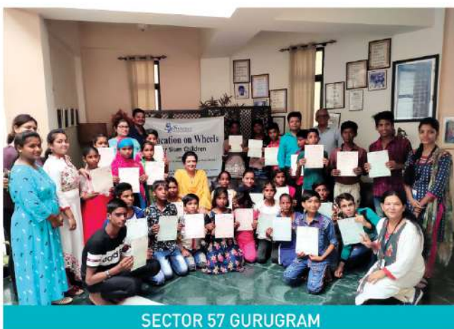
SECTOR 57 GURUGRAM