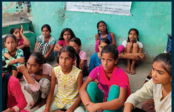
HOTI CAMP DELHI