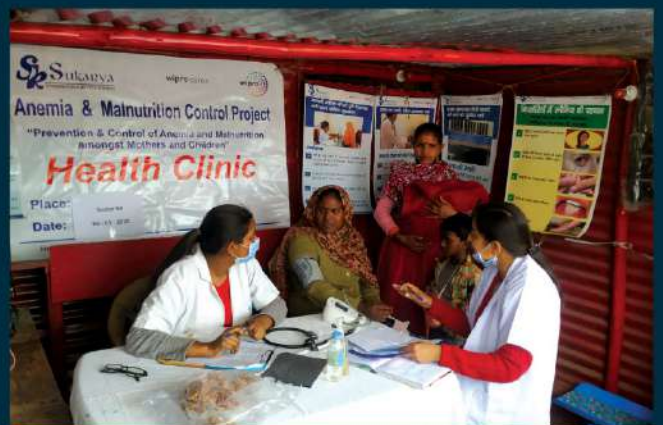
SECTOR 58 GURUGRAM