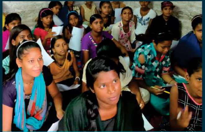
TARACHAND CAMP DELHI