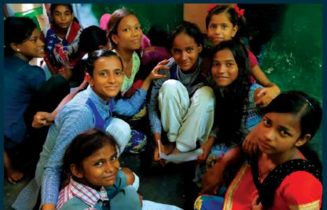
SONIA GANDHI CAMP DELHI