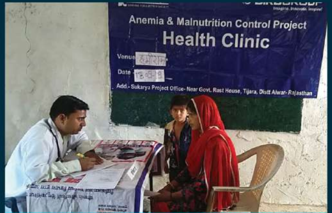
HAMIRAK VILLAGE, TIJARA RAJASTHAN