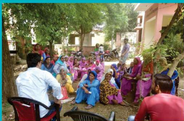
MANDHA VILLAGE, TIJARA RAJASTHAN