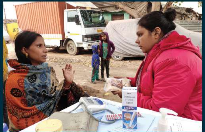
SONIA GANDHI CAMP SLUM, DELHI