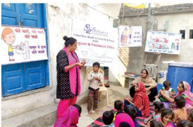
SONIA GANDHI CAMP DELHI

112 HYGIENE PROMOTERS DEVELOPED ACROSS THE 14 PROJECT LOCATIONS